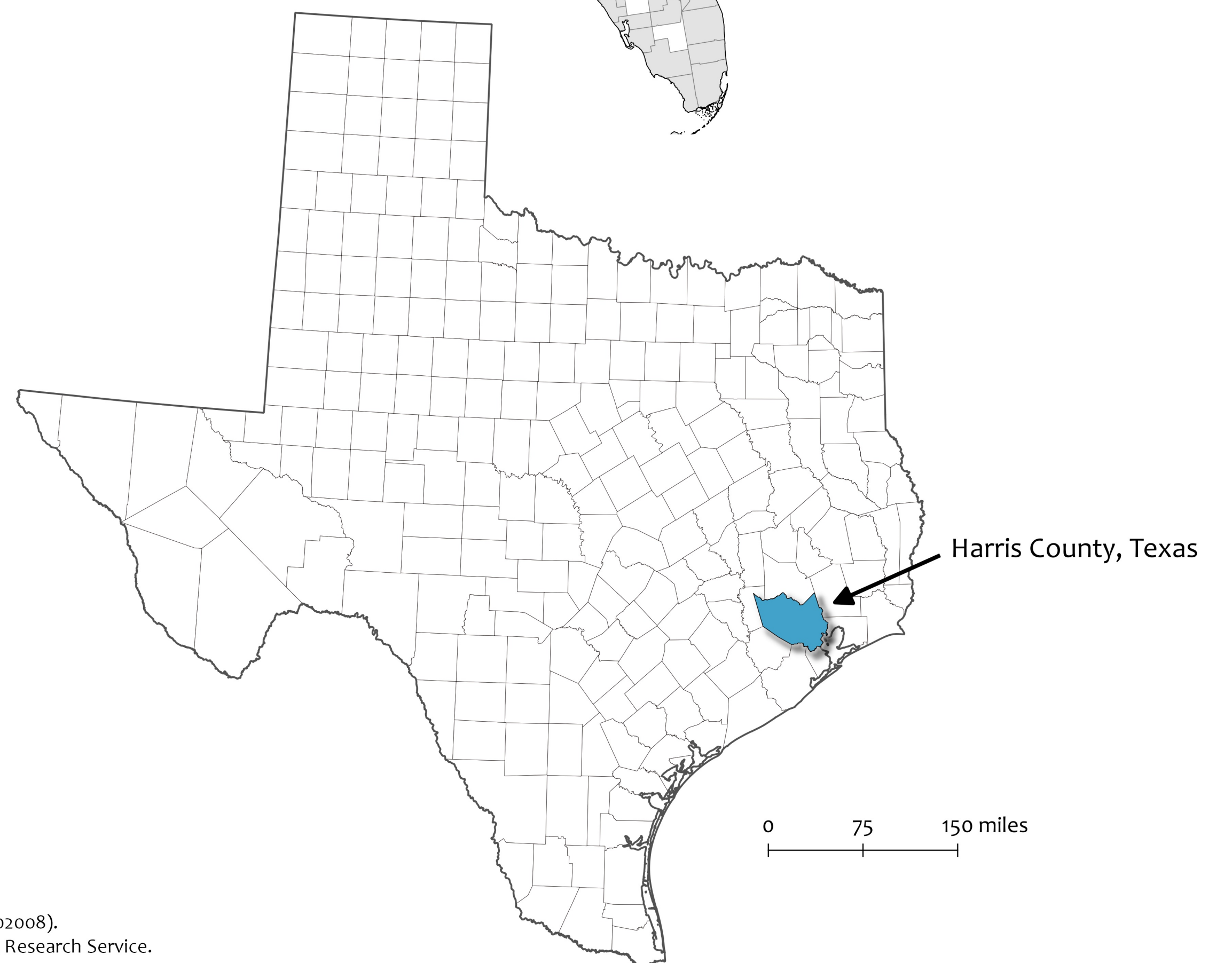
Harris County, Texas

The 16 flea markets in Harris County, Texas, take advantage of the county's large population due to its being in the Houston metropolitan area. With such a high population, the rate of flea markets per person is also much smaller.